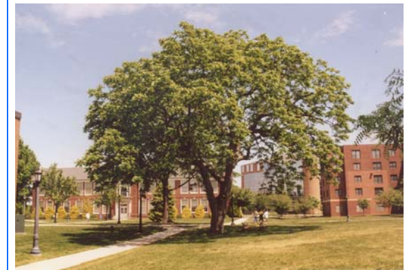
Black walnut, Juglans nigra (Campus Tree #71), one of the oldest trees on campus.

A botanical walk through the beautiful DSU campus